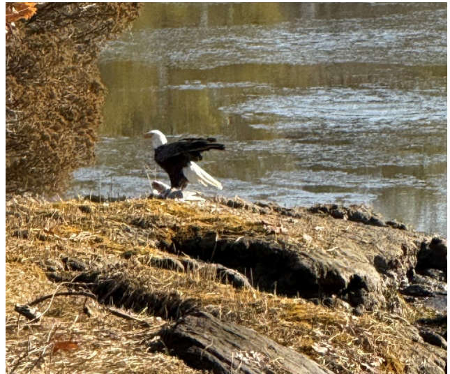
Bald eagle on the Oyster River

Creations, paintings, and photographs have been loaned to inspire us to protect the environment so future generations can thrive and enjoy its beauty. Some works have been made from items found in nature, others involve the principals of reuse and recycle – buttons, yarn, trash, etc.