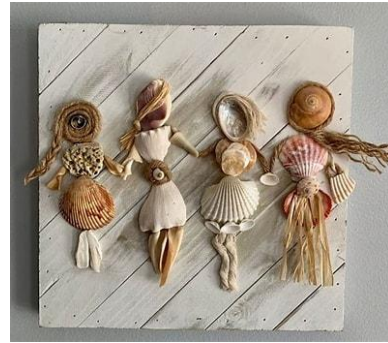
Sea Shells for sculpture, painting or shadow box