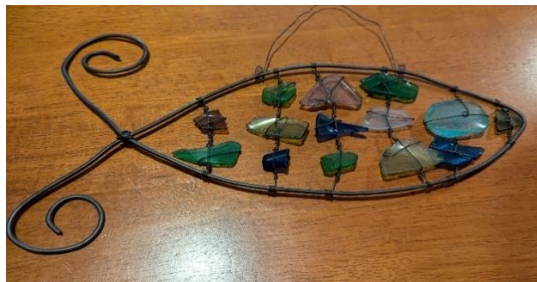
Sea Glass Sculpture