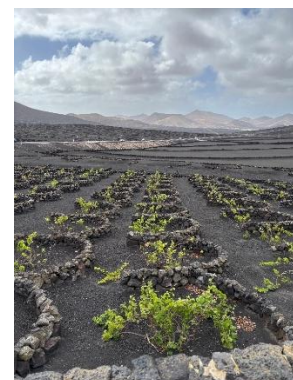
Vineyard in volcanic soil