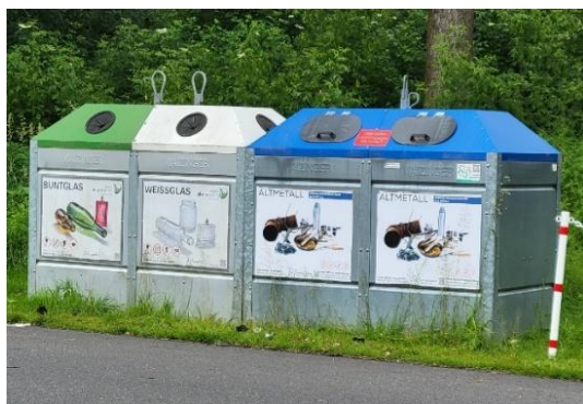
Trash Containers Vienna Austria